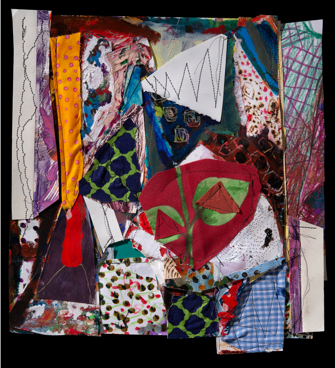
“Moths In The Closet,” textile and acrylic