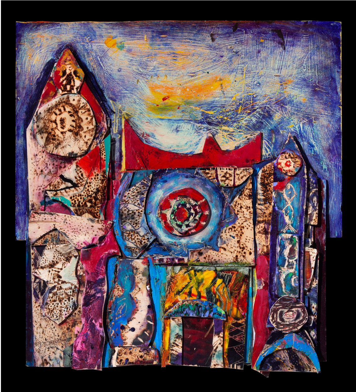
“Guanajuato,” Wood and Acrylic