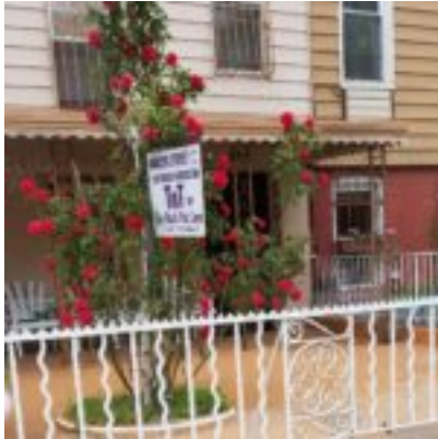
Macon Street, Brooklyn 2020

When I returned to Brooklyn, the sun was bright, my apartment cleaned but utterly rearranged. It was jarring, disturbing, it felt like a violation. The kind person who stayed in my space for a couple of months had tried to make the space her own and that makes sense but she failed to put things back. And all of this was while dealing with the extreme lock down in New York City.